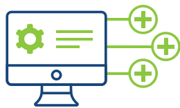
EHR Integrated On-demand Faxing